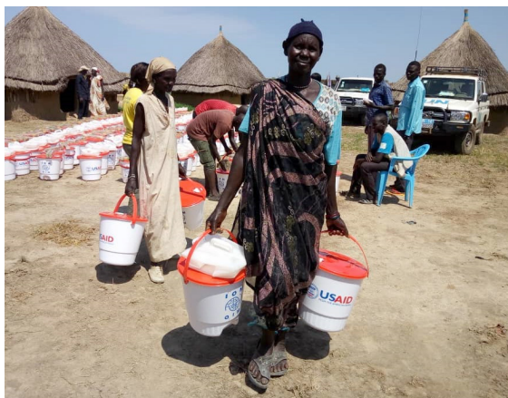
WASH NFI distribution in Mayom.