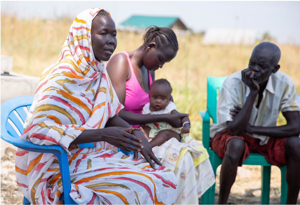
A water management committee in at the Joppa solar water yard in Juba take part in a feedback discussion session with IOM's WASH team.