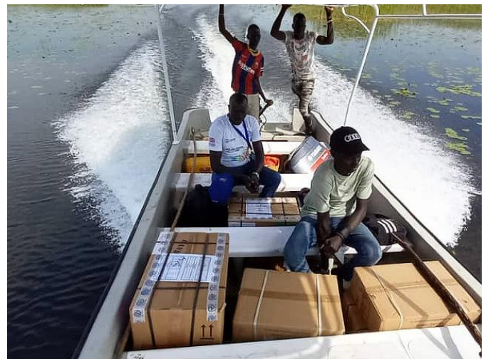
Delivery of essential medical supplies by IOM Health Rapid Response Team to flood affected population in Panyijar county, Unity state