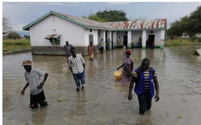
Emergency Health response , Twic East 2021