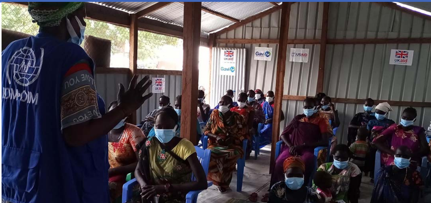
IOM community midwife providing Sexual Reproductive Health Education at the IOM Sector 3 clinic, Bentiu IDP camp.