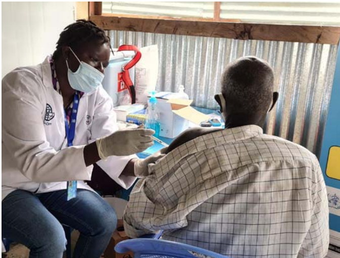
IOM vaccinator providing COVID 19 vaccine in the IDP Camp in Rubkona

IOM continued to support point of entry disease surveillance at the Nimule PoE where IOM is conducting COVID-19 screening of travellers at Nimule border land crossing. In this quarter, a total of 46,936 travellers (30,364 men, 11,966 women, 2,212 boys and 2393 girls) were screened for COVID-19.