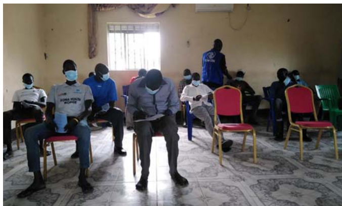
Training of Boma Health Workers in Twic East, Jonglei state

teams have been responding to the displaced population in the new displacement sites A,B,C,D and E and to populations cut off by the flood waters in Pakur and at the cattle camps in Thong and Rothriah in Unity state since August 2021 through weekly mobile clinic services to the various locations, reaching a total population of 126,784 individuals including 103,963men, 53,021 women,11,639 boys and 11,182 girls.