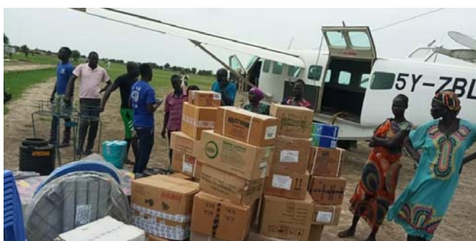
Delivery of essential medical supplies to Akobo West during the 2021 flood emergency response

During the period October to December 2021, IOM MHU reached 236,959 beneficiaries.