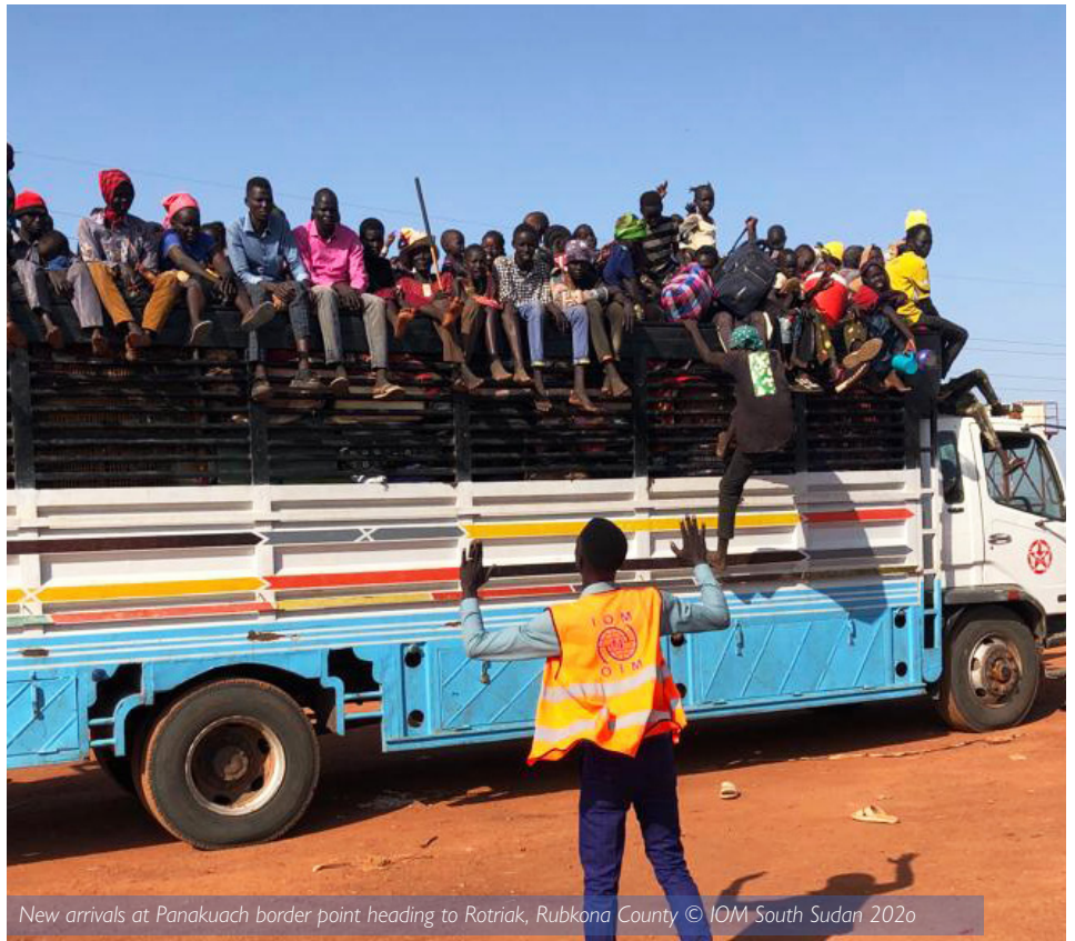
New arrivals at Panakuach border point heading to Rotriak, Rubkona County

individuals provided with onward transportation assistance (As at 1 June 2023)