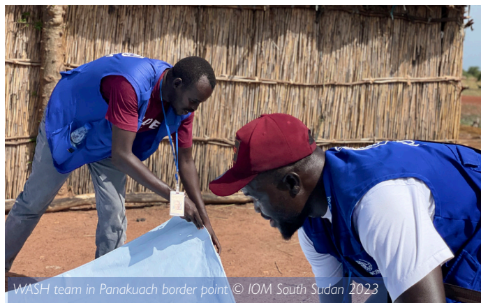
WASH team in Panakuach border point