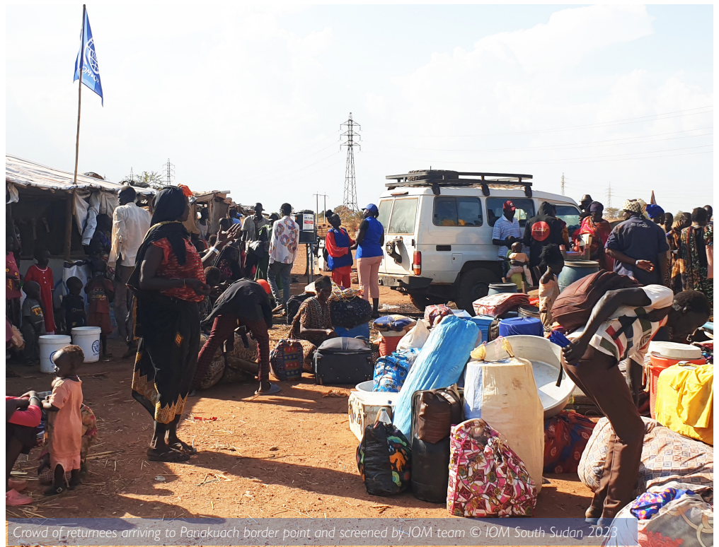
Crowd of returnees arriving to Panakwach border point and screened by IOM team